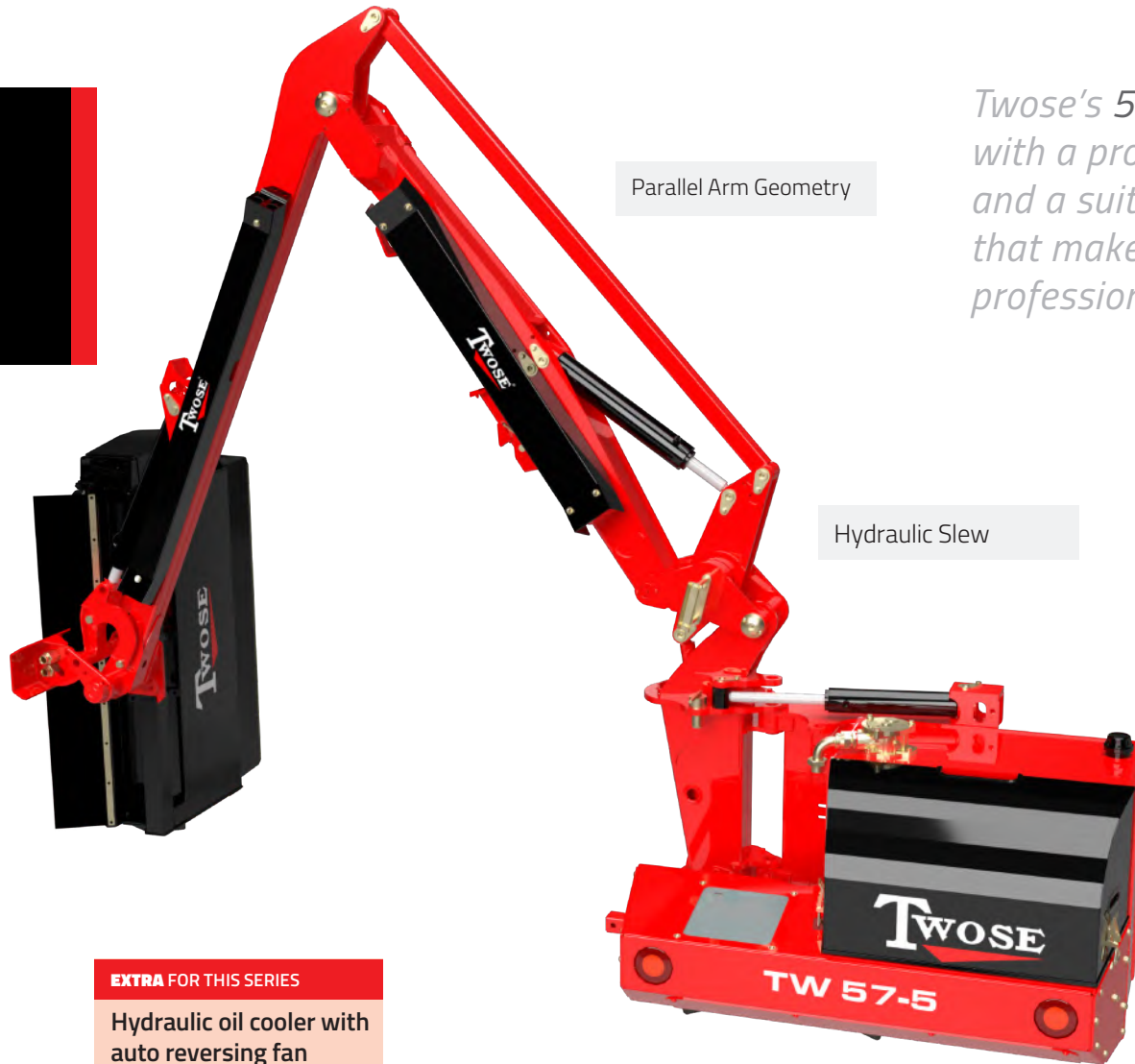
Parallel Arm Geometry