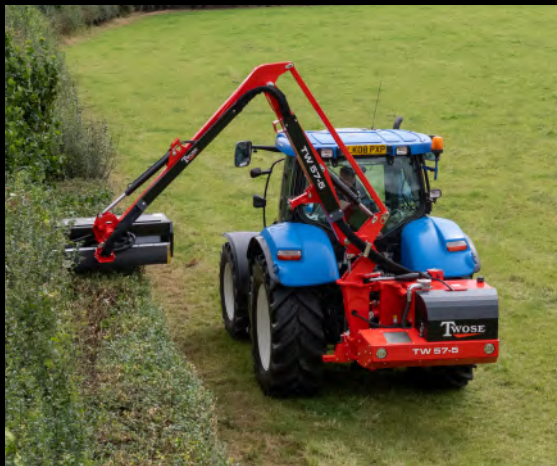
Oil cooler fitted as standard. See page 20 for details

Three different armsets are available including: Standard; Telescopic – for added extra reach on demand; and Variable Forward Reach (VFR) – enhancing comfort, visibility and reducing fatigue.