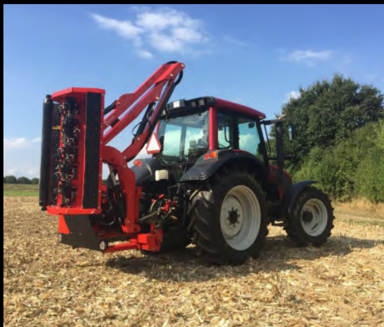
The 4-Series incorporates Hydraulic Slew. See page 21 for details.

Compatible with tractors of just 60hp and upwards, the machine is equipped with a double-skin heavy duty 1.2m flailhead and is available with more than 10 different cutting attachments, including Sawheads and Cutterbars.