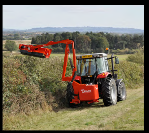
Featuring Low Pressure hydraulic controls. See page 19 for details.

With a choice of control systems, including Twose's proven low pressure hydraulic proportional joystick, the TW 50-3 is intuitive and easy to master and comes with a wide range of working attachments from Cutterbars to Sawheads.