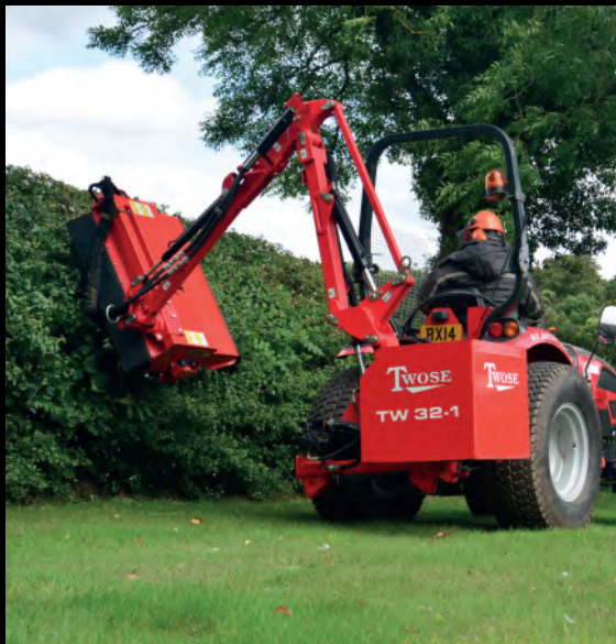
The Twose Sliding Mount Direct Drive Flailhead.

Highly adaptable, 1-Series machines can be fitted quickly and easily on a wide range of utility vehicles. Their low horsepower requirements mean they are compatible with tractors of just 35hp (TW 32-1) or 50hp (TW 42-1).